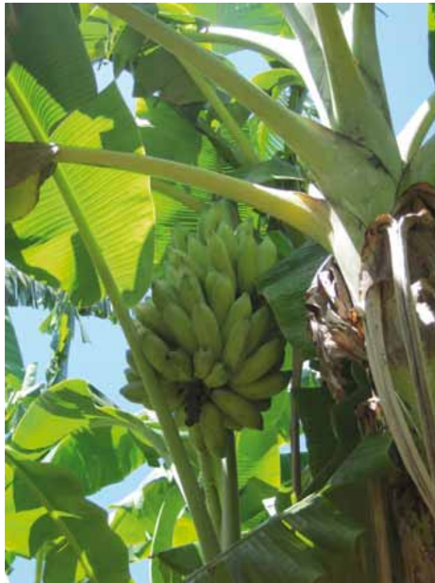
Paysage de La Réunion : bananier © B-A Gaüzère.